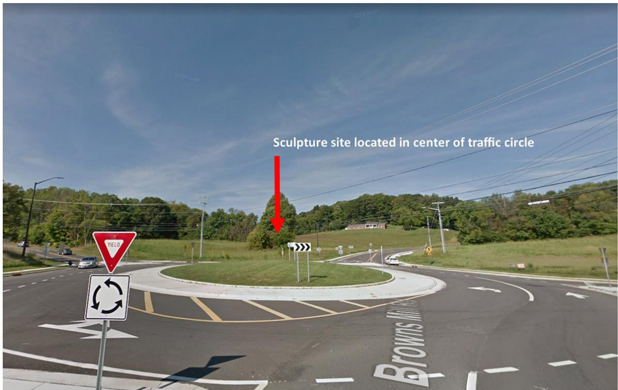
Location: Traffic Circle at Browns Mill Rd. and W. Mountainview Rd. Intersection

The following four new sites have been added for the 2021-23 leased art period: