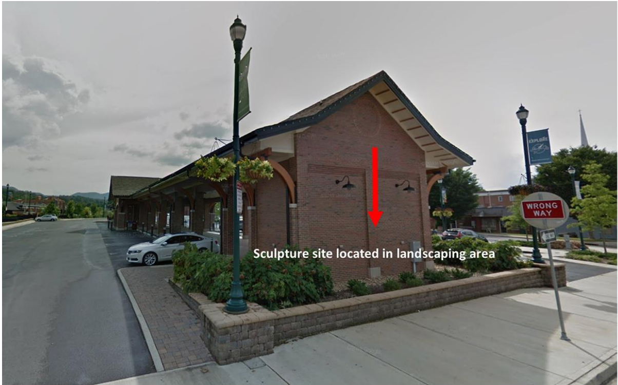
Location: Pavilion at Founders Park (100 E. Market St.)